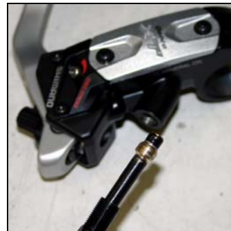
3. Unscrew the connecting bolt and remove the line from the lever.