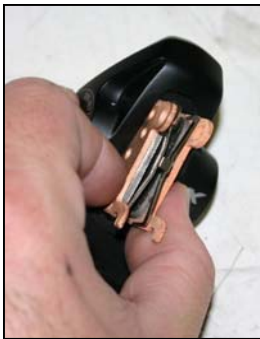
1. Remove the brake pads.